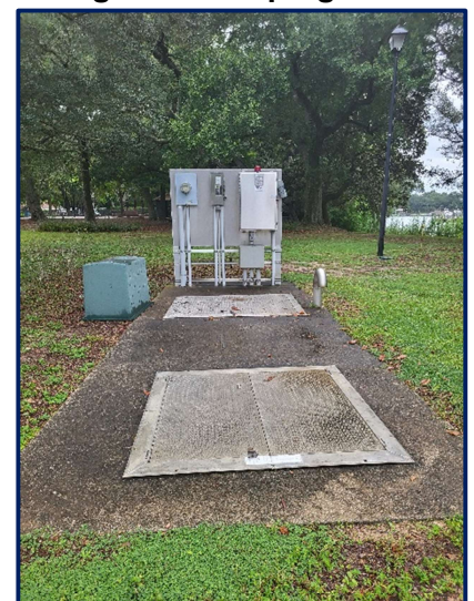
Regional Pumping Station

Communal public system is pressurized to flow uphill by a network of private Grinder Pumps on private residential property.